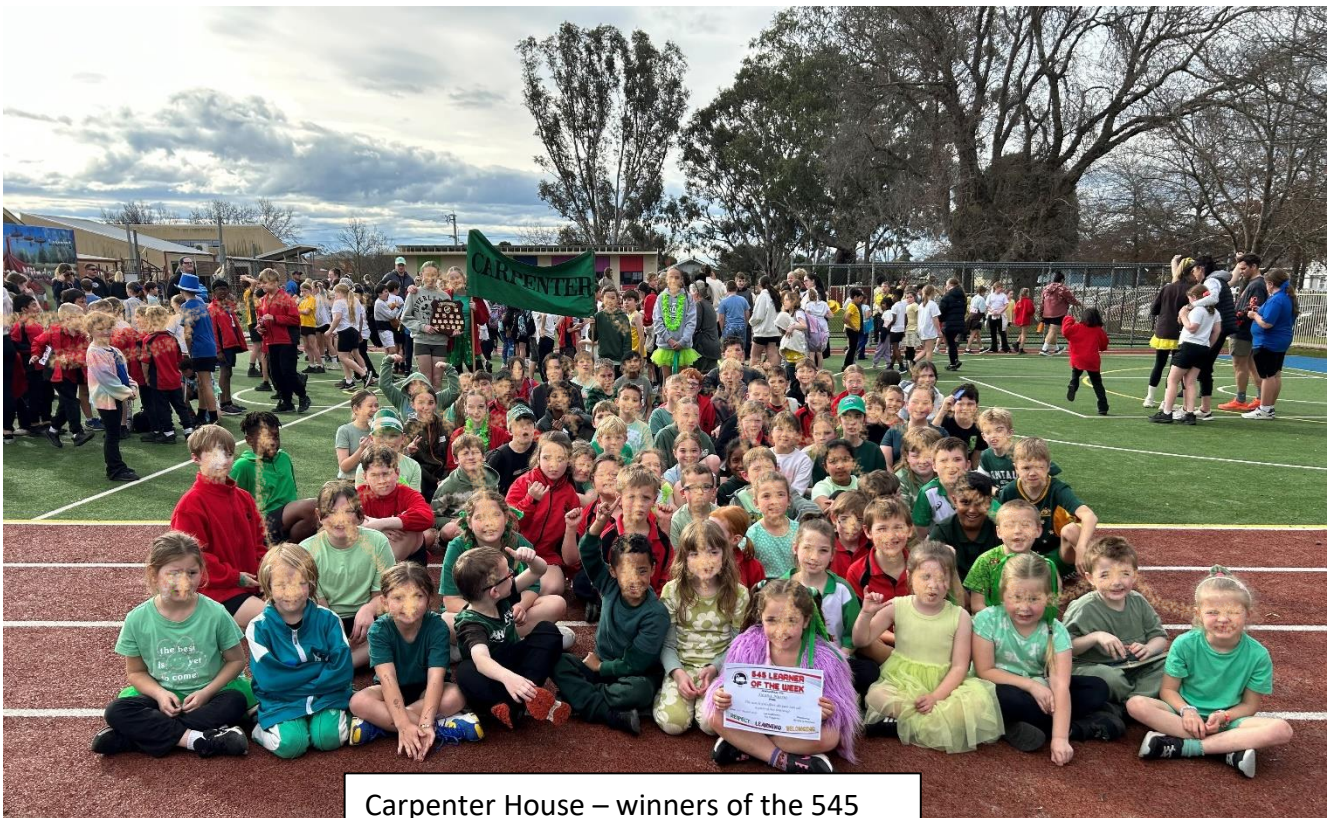
Carpenter House – winners of the 545 House Athletics Carnival