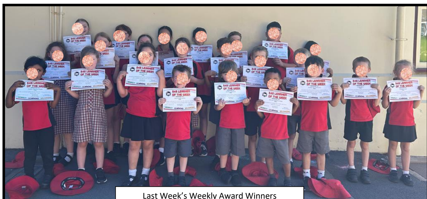
Last Week's Weekly Award Winners