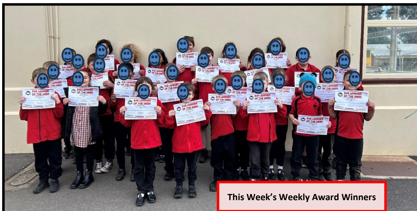
This Week's Weekly Award Winners