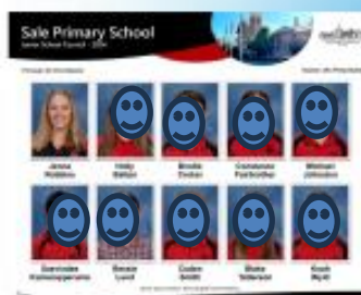
Junior School Council