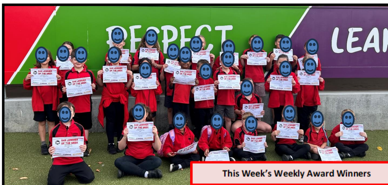
This Week's Weekly Award Winners