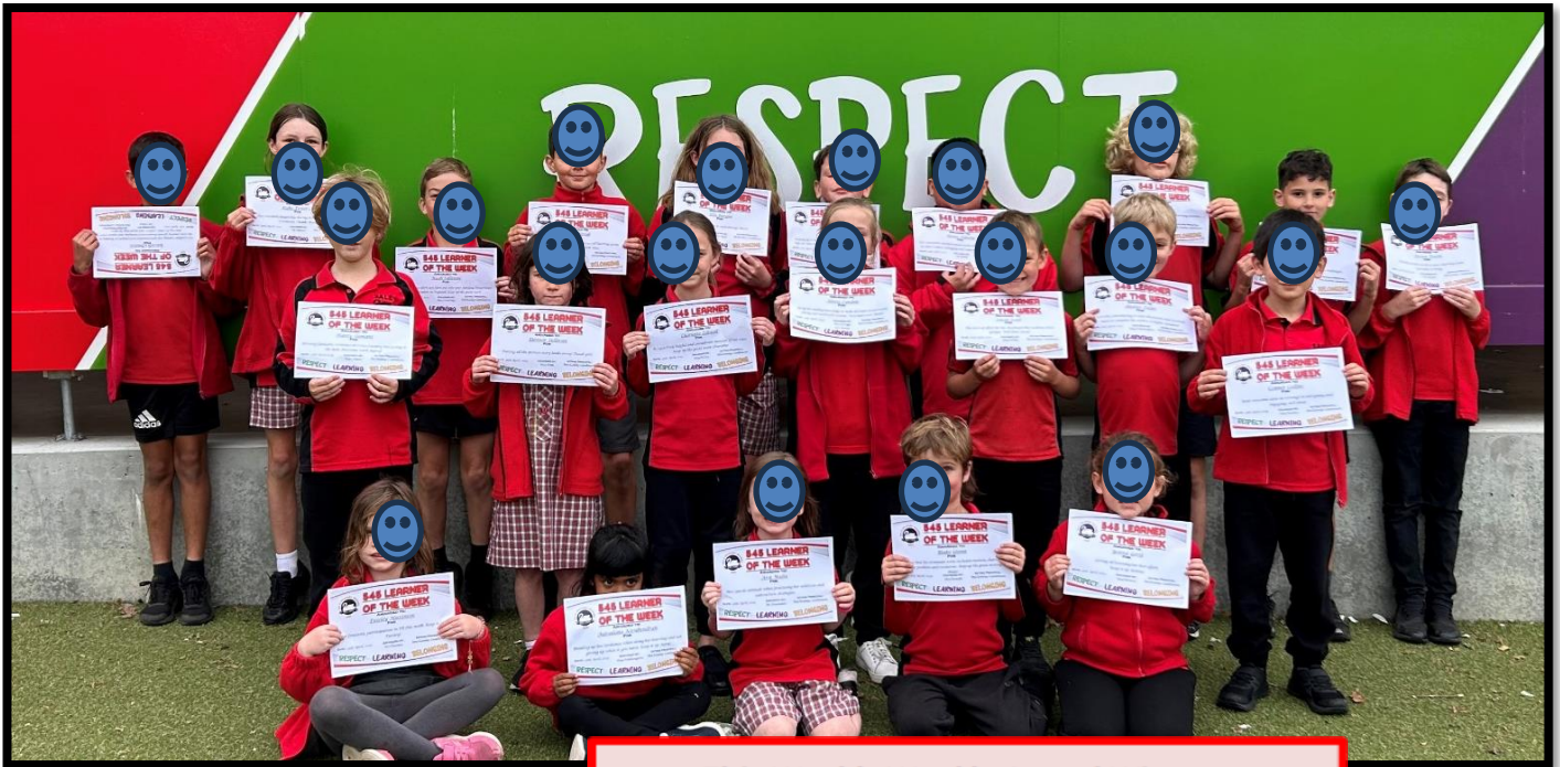
This Week's Weekly Award Winners